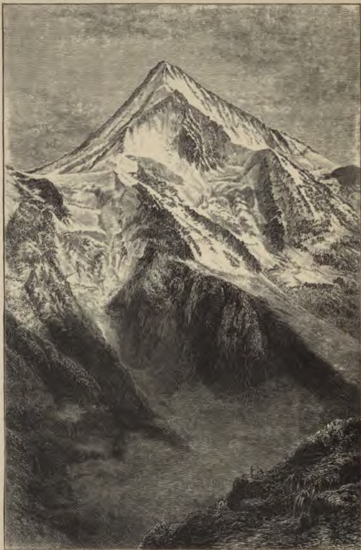
THE BIETSCHHORN, FROM THE PETERSGRAT